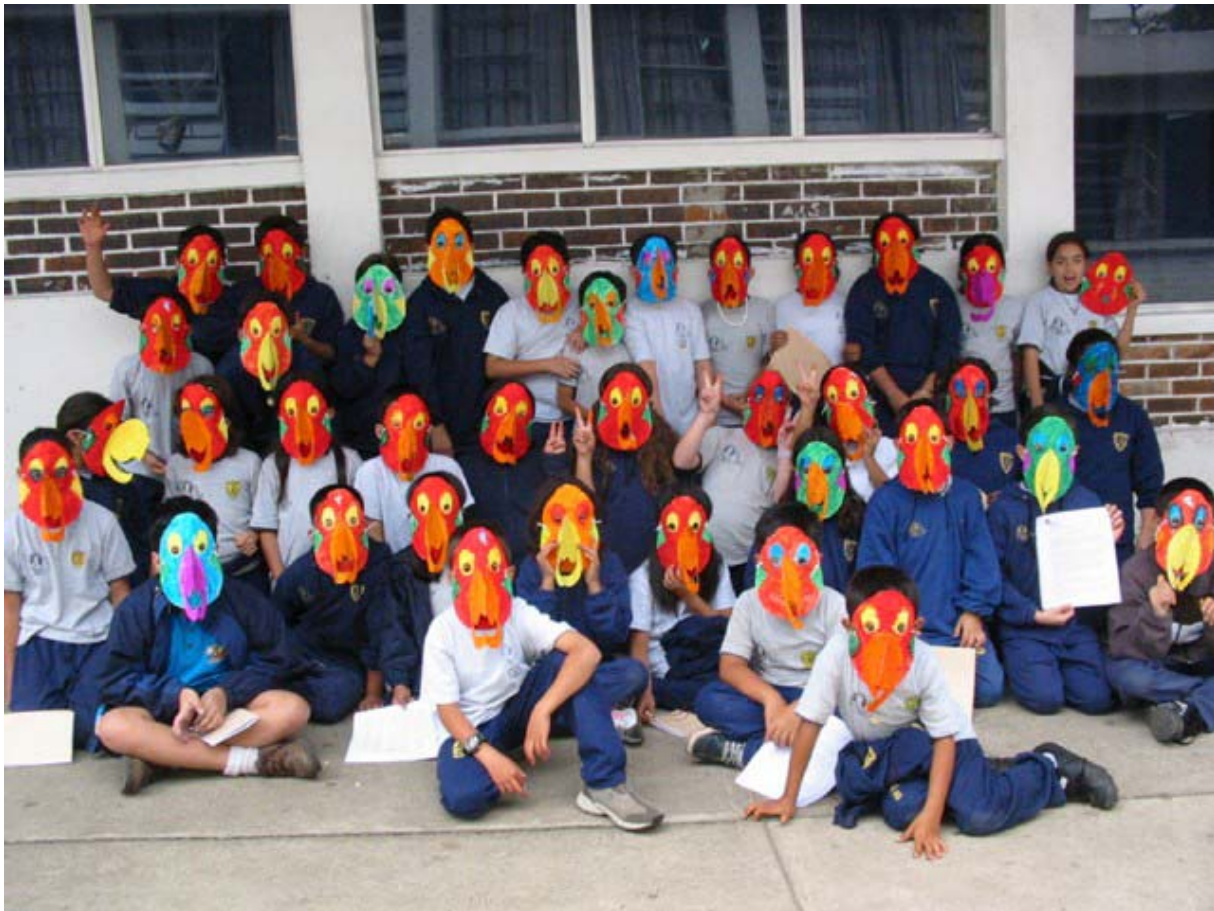
School children in Guatemala with their toucan masks.