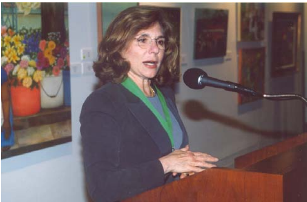
Mrs. Teresa Heinz delivering her acceptance address after receiving the World Ecology Award.

“The environment must again be front and center in our national dialogue. It must again be a rallying cry, which is how we got the Clean Air Act, the Clean Water Act, and the creation of the Environmental Protection Agency itself during the Nixon Administration. The health of our planet depends on it. But so does the health of our democracy. To show how we genuinely care about this great tree called America, this tall and fragile American elm, this proud colossus of the forest, we must do more than sing its praises. We must nurture the soil in which it is planted. That is our mission, and I urge you to join together in pursuing it with the passion and fervor it deserves.”